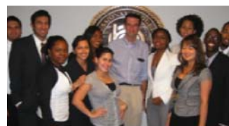
Summer Fellows with Peter Orszag, current director of the White House Office of Management and Budget.

Training will take place at the Urban Institute in Washington, D.C. from June 7 through August 1, 2009.